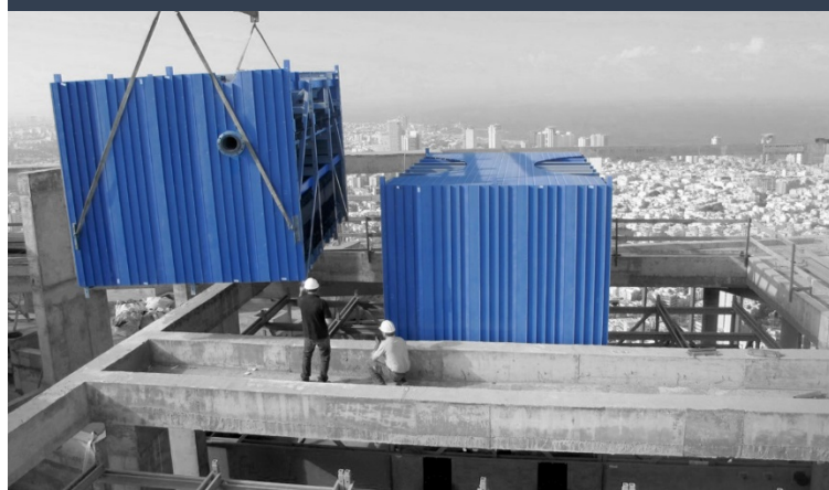
Modular Cooling Towers