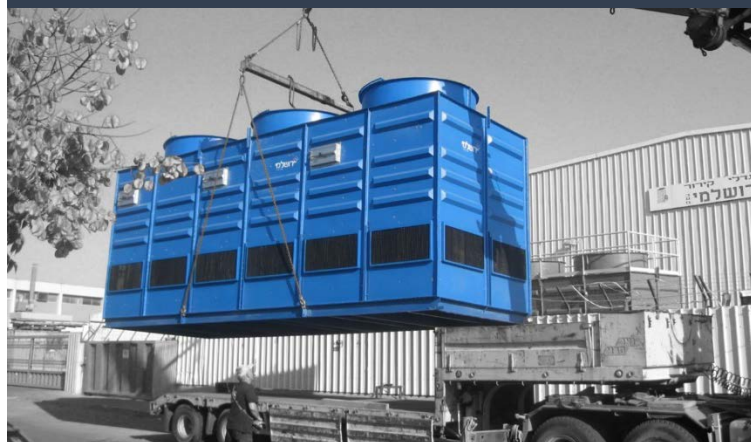
Factory-made cooling towers